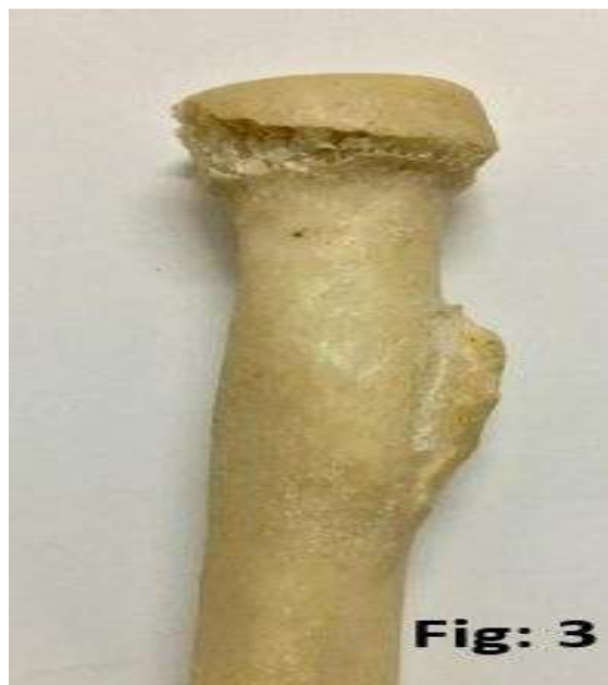
Figure 3: Left Radius bone showing enthesophyte