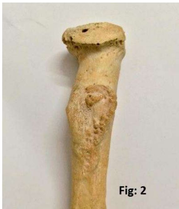
Figure 2: Right Radius bone showing enthesophyte